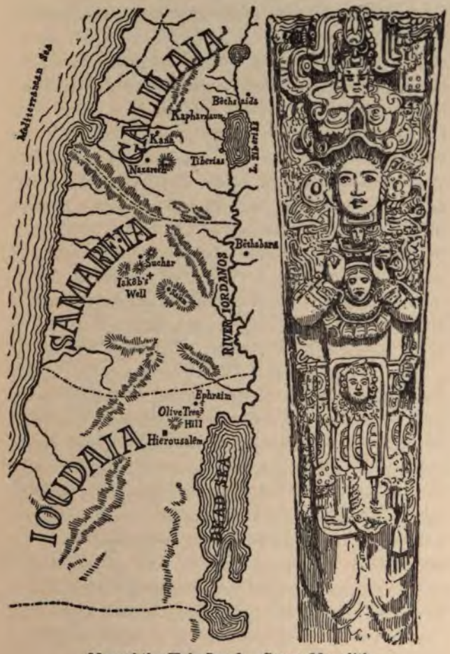
Map of the Holy Land. Copan Monolith.